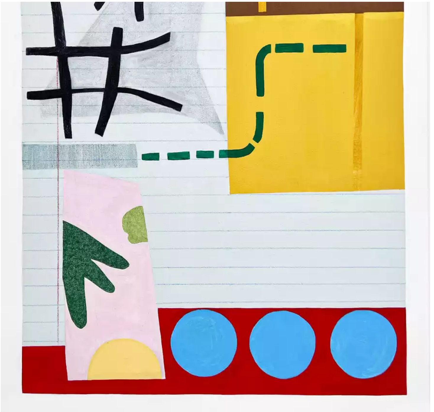
Rebekah Andrade Big Kid Noodles, 2023 US$3,200