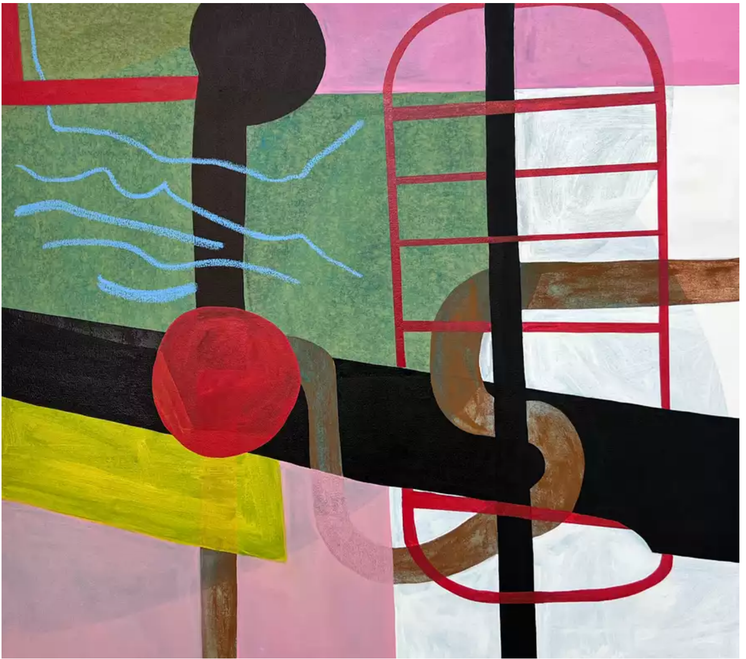
Rebekah Andrade Air Drying Laundry, 2023 US$3,600