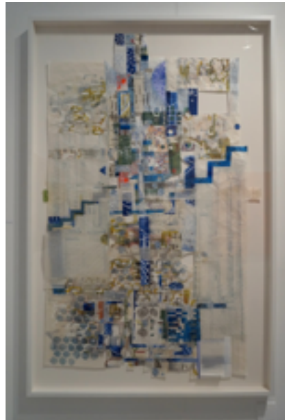
Fran Siegel, “Balancing Act 2” (2013), colored pencil, paint, ink, and collage, 60” x 36”

“Balancing Act 2” result in an ordered maze that hangs together with an internal conceptual logic.