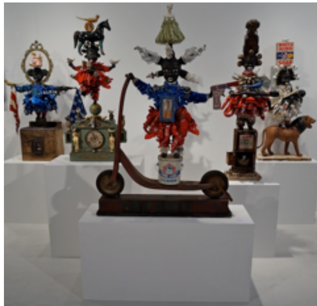
Work by Vanessa German

Then there are the fantastic sculptures of Vanessa German, also at Pavel Zoubok and nearly the first things you see when you enter the fair. German's mixed-media assemblages feature black dolls posed atop miniature improvised pedestals — a lion, a desk, a can of lard. The dolls pose with their arms out, like circus ringmasters, and they're covered in elaborately surreal costumes made of accumulated objects — more dolls, locks, toy guns, plastic cars. The aesthetic is somewhere between junk art, voodoo dolls, and nkisi nkondi. In one piece, an angry doll stares out at the viewer as little white, ceramic heads sprout from her hair and a giant box of "White King Soap" sits atop her head (while she also stands atop a lion and holds a black baby). The message seems clear: the weight of white American culture forces African Americans into a juggling act.