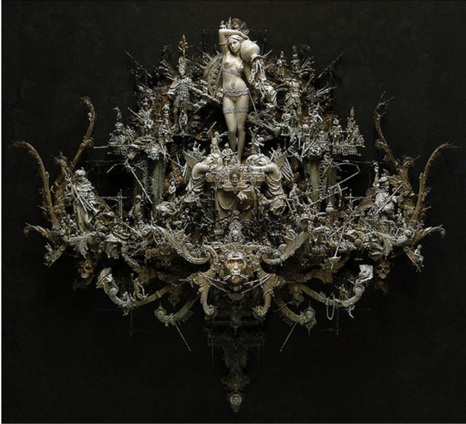
The Arousal of De-evolution by Kris Kuksi

by Nastia Voynovskaya Posted on July 13, 2012