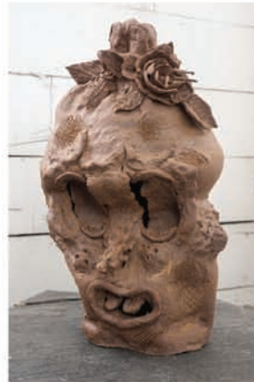
Allison Schulnik | Hobo Clown with Long Nose , 2011, ceramic and wood pedestal, 17 x 10 x 10 inches (ceramic), 34 x 10 x 10 inches approx. (pedestal), Courtesy ZieherSmith