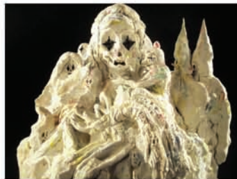
Allison Schulnik | Still from Mound, 2011, video, drawing, sculpture, box, 4:33 in length, Courtesy ZieherSmith

In the main gallery space, "Mound," a stunning stop-motion video, and the source of the soundtrack, is projected to fill an entire wall. Figures and landscape melt into one another, becoming at points, one large undulating mound. On the adjacent walls, similarly-scaled paintings, "Flower Mound" (100" x 148") and "Idyllwild" (110" x 78") are awesome in their size and craftsmanship. Schulnik moves seamlessly between media, and from large-scale to smaller, more intimate pieces like "White Flower" (ceramic and wood, 37" x 29" x 29") with the same amount of detail and care. This tangible transition from painting to film to object brings us fully into the Schulnik world of comic/tragic ruffians, kittens and puppets. I had the opportunity to ask Allison a few questions about her show and the influences in her work... - Alex Ebstein, Baltimore Contributor