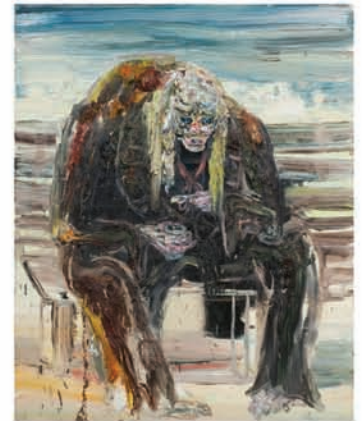
Allison Schulnik | Yogurt Eater , 2011, oil on linen, 84 x 68 inches, Courtesy ZieherSmith

AE: Do these things still influence your work?