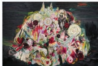
Allison Schulnik | Flower Mound, 2011, two panels joined together, ships separately as 100 x 74 each, Courtesy ZieherSmith