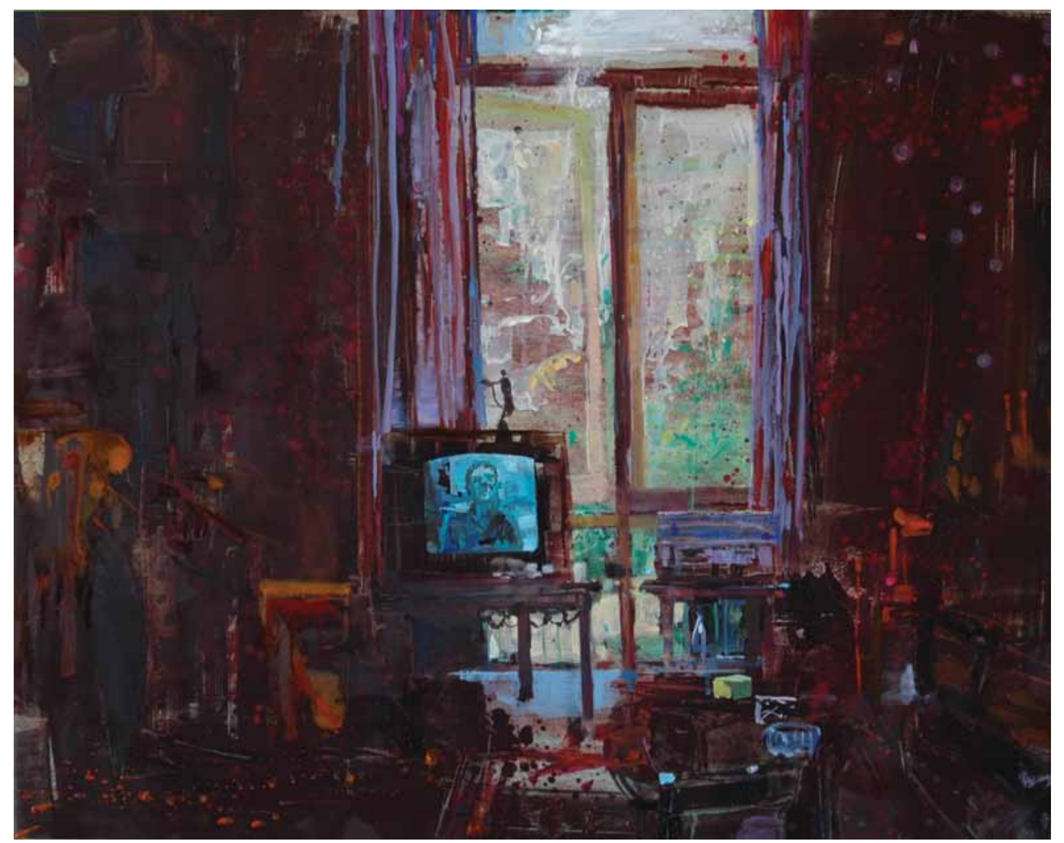
Angela Dufresne, Me in the TV (from Antonioni's 'The Passenger'), 2006, oil on panel, 24" x 30." Courtesy of the artist.

Koons' show at the Whitney Museum, "From the first supporters of the Cubists to the critics and collectors who embraced Abstract Expressionism early on, the bewilderment one sometimes experienced on encountering new art was embraced as a complicated intellectual challenge, demanding new alignments of sense and sensibility."<sup>5</sup> But decades of challenging art predicated on shock (amply described by Robert Hughes in The Shock of the New ) with Freudian undertones (analyzed by Hal Foster in Compulsive Beauty ) may have limited our understanding of what constitutes greatness in art. What shocks us today becomes habitual—even disparaged tomorrow. Revelatory experience is qualitatively different in its effect on us from shock, and isn't undone by habituation. The slow revelation of a Bonnard painting is similar to the sharing of secrets; it increases awareness, and forges intimacy and connectedness.