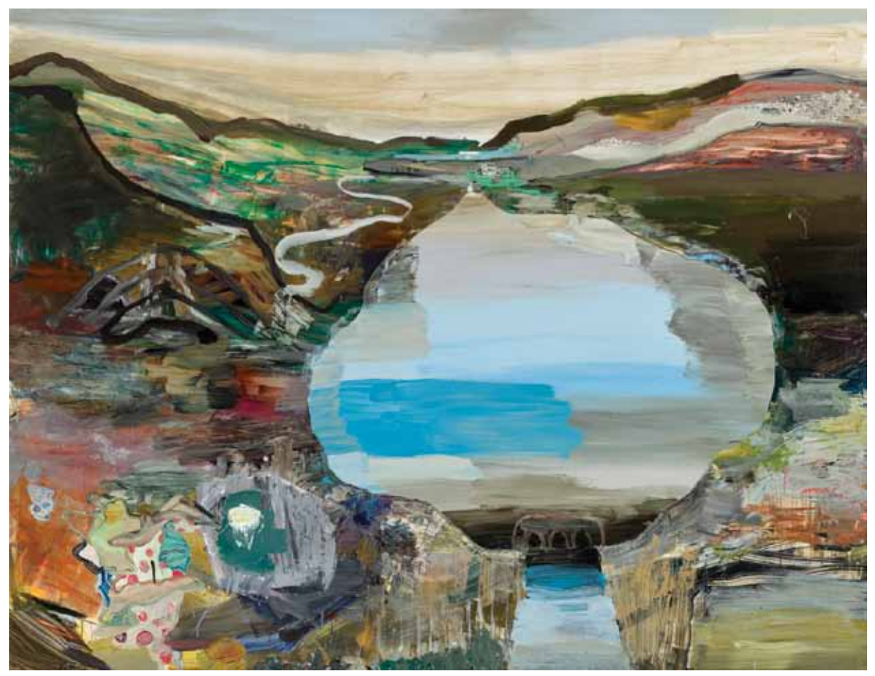
Lisa Sanditz, Underwear City, 2008, oil on canvas, 68" x 87."