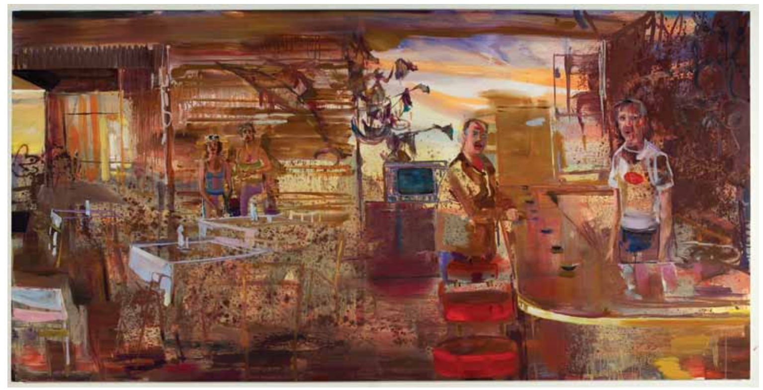
Angela Dufresne, Strangers When We Met Gay Bar, 2010, oil on canvas, 4.5' x 9.'

Press your forehead close to someone else's: a single eye will float forth and the nose will dislocate in a decidedly Cubist way. Press your eyelids while facing light and you will see geometric patterns of bright sparks like Op Art. We all know that we can manipulate what we see and that that ability forms a part of our visual knowledge of the world. Learning to notice more of the myriad peculiarities of perception and formalizing them with tools and concepts constitutes the methodology of art making. Those who can communicate something expressive of the unique particulars of their own visual experience and connect it to others-those people are artists. Certain great ones, Cézanne and Van Gogh among them, made work that forges a direct link with viewers in a very specific way, by re-creating how they themselves actively experienced the process of looking. The kinds of marks they made-their dots and dabs, precise erasures, the way they rubbed and overlaid their colors-all those things provide viewers a virtual transcription of the lived experience they had with their painted motifs-whether cypress trees or peaches in a bowl-as viewed in the moment, essentially allowing us to see through their eyes as though we are neurologically linked to them. Much has been written about Bonnard's exquisite mechanisms for notating his world stemming from his oft-quoted observation that painting was, for him, "the transcrip-