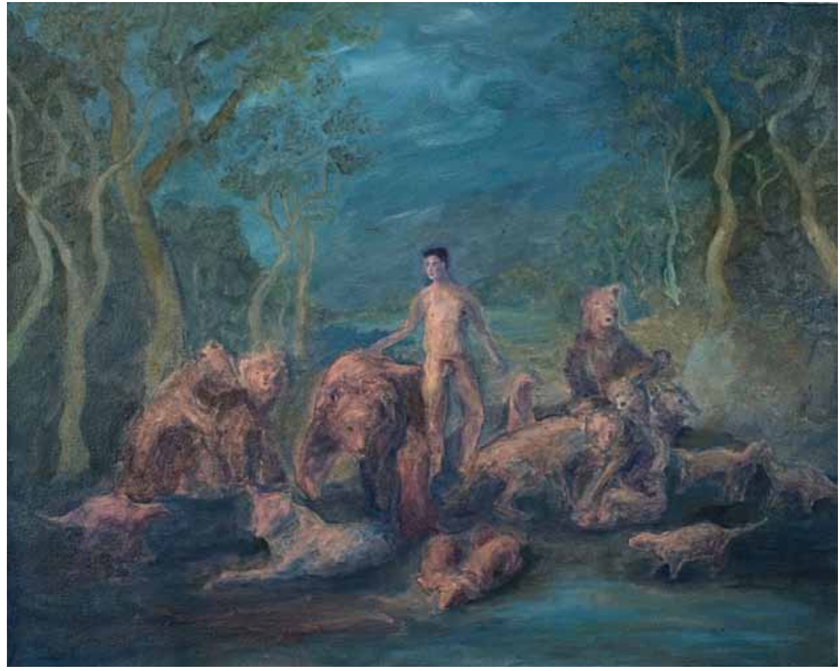
Kyle Coniglio, Self Portrait with Bears, Otters and Wolves, 2009, oil on canvas, 20" x 24."