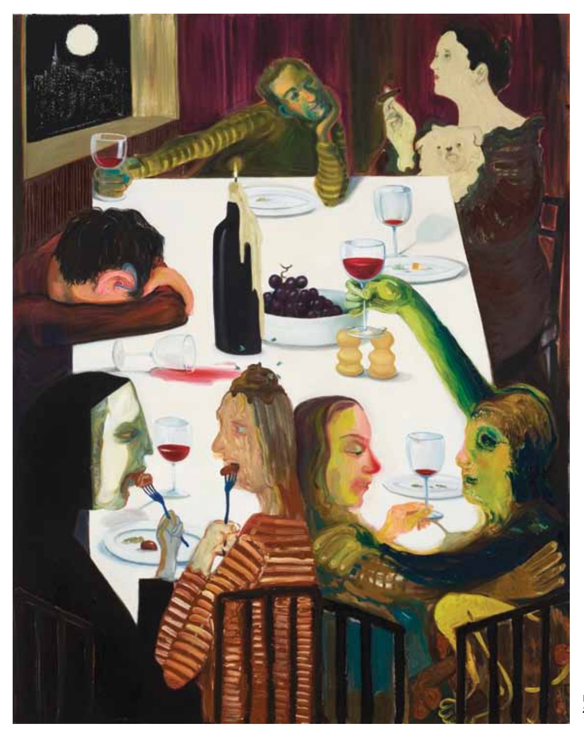
Nicole Eisenman, Study for Winter Solstice 2012 Dinner Party, 2009, oil on canvas, 20" x 16."

poignant, without mockery; how to play out the slow revelation with perfect timing, implicating the viewer in the ramifications of each and every mark made. These are not small tasks.