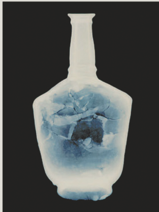
"HISTORY'S SHADOW AV7," 2010

D URING a residency at the Getty Research Institute in Los Angeles several years ago, I began to think about images that were created in the course of art preservation, where the realms of visual art and scientific research overlap. While taking photographs at the conservation department of the J. Paul Getty Museum, I became captivated by X-rays of art objects