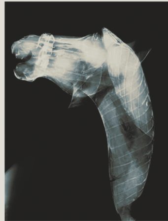
"HISTORY'S SHADOW AB7," 2010

from the museum's permanent collections. These ghostly images seemed to surpass the potency of the original objects of art. They were like transmissions from the distant past, conveying messages across time, and connecting the contemporary viewer to the art impulse at the core of these ancient works.