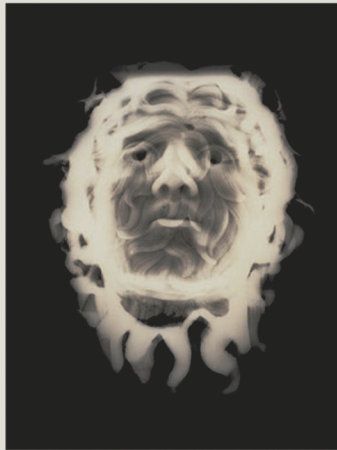
"HISTORY'S SHADOW GM5," 2010