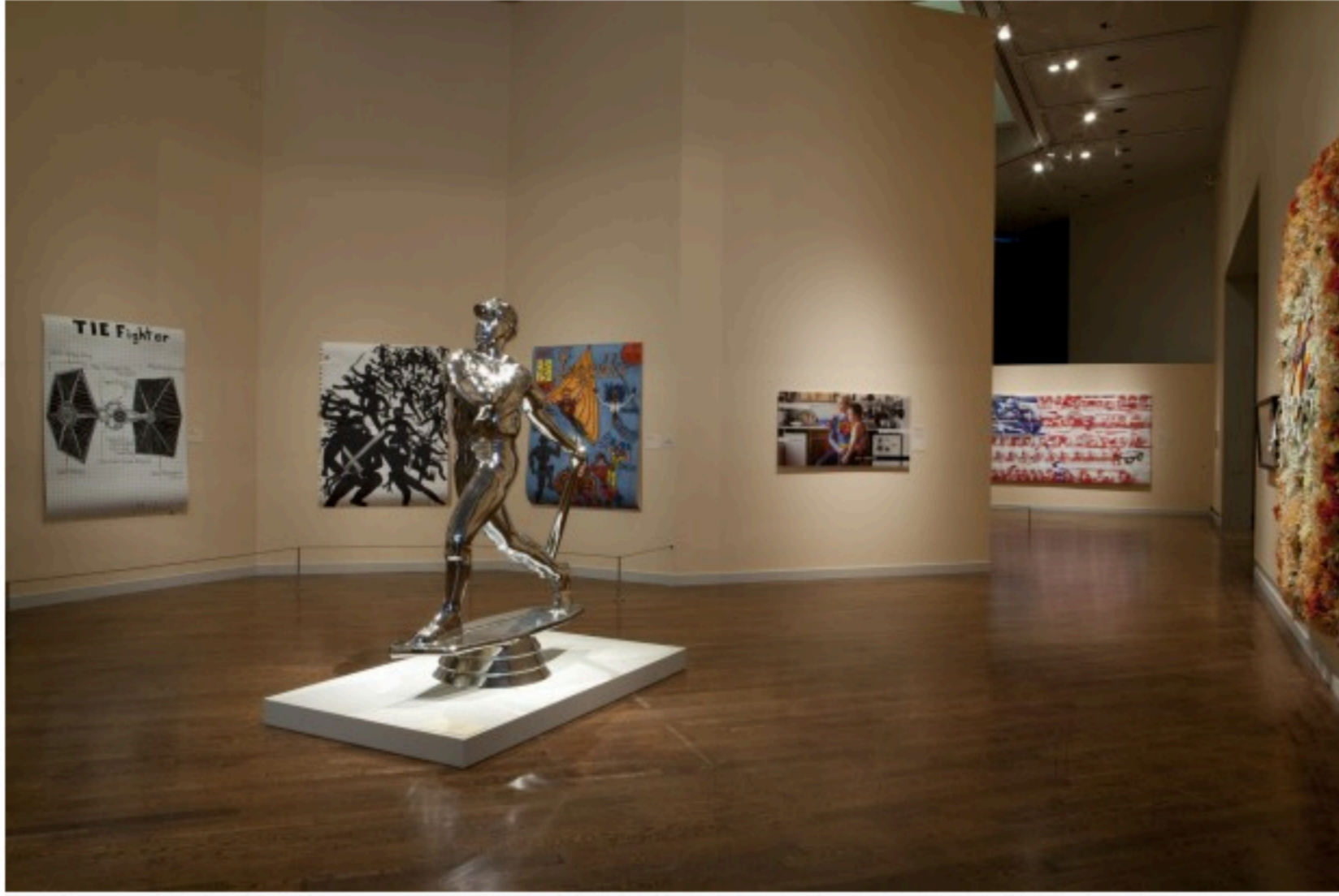
"Trophy Topper," part of the "We Could Be Heroes," at the BYU Museum of Art, on display through April 6, 2013.

December 20, 2012 12:05 am • Cody Clark - Daily Herald