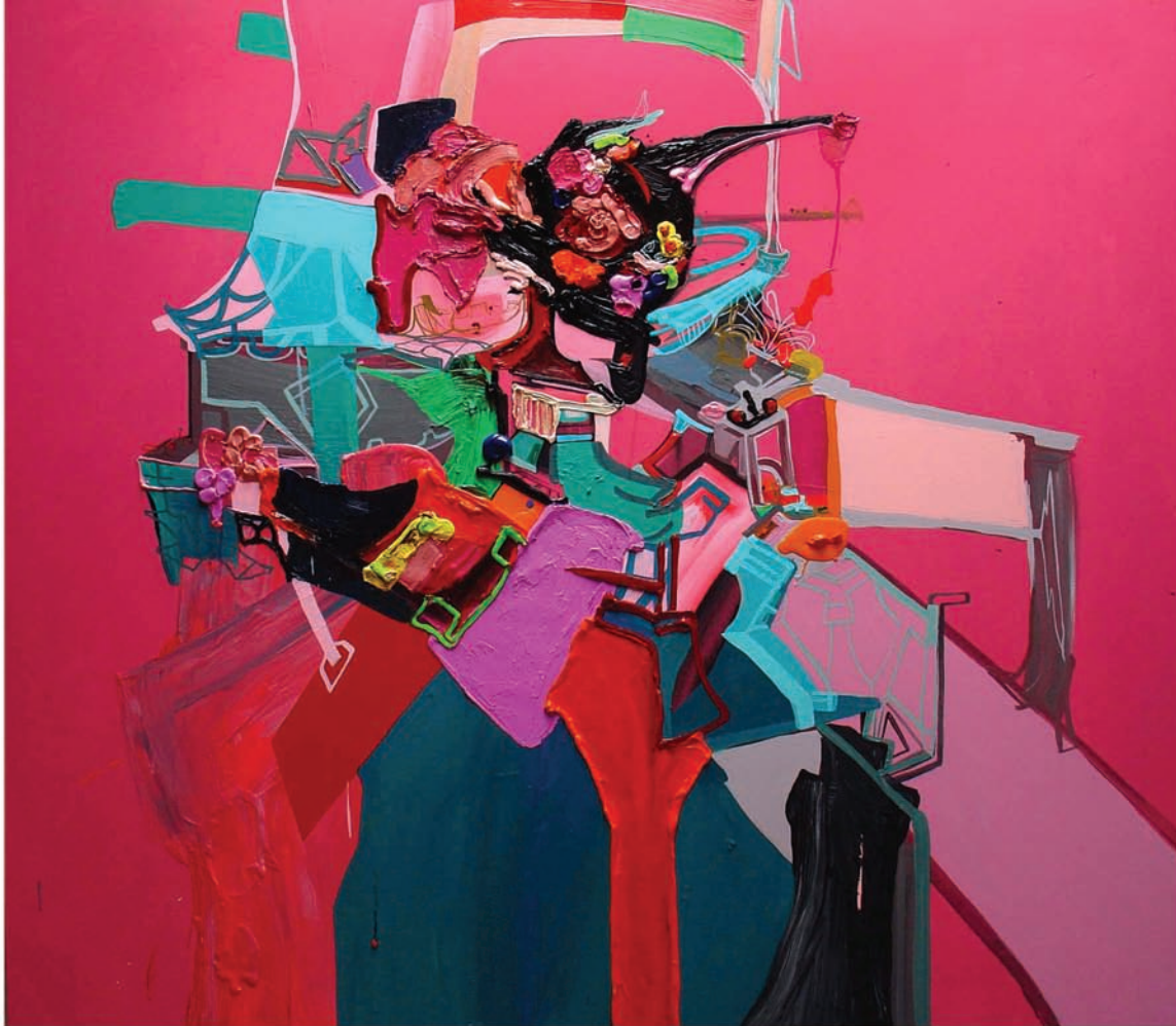
Special Effects Armored Love , 2006. Acrylic and oil on canvas, 80 x 70 inches Chaney Family Permanent Collection, TX