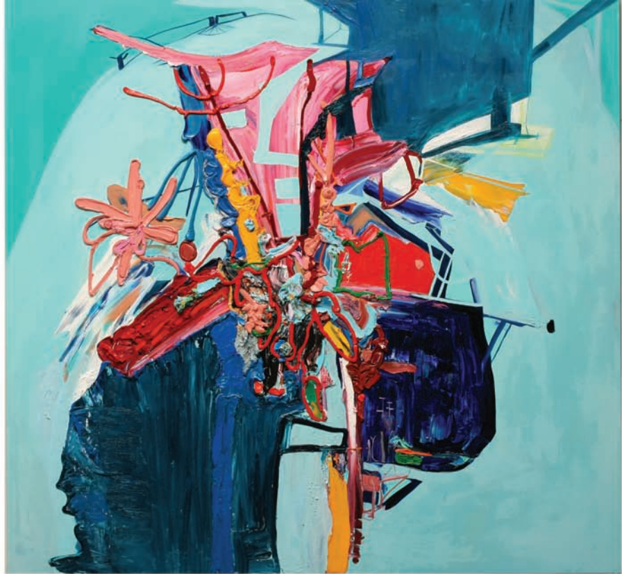
Left: Heavy Metal , 2008. Watercolor, gouache and pencil on paper, 15 x 10 inches Right: Siren Crown , 2007. Oil and acrylic on canvas, 64 x 68 inches