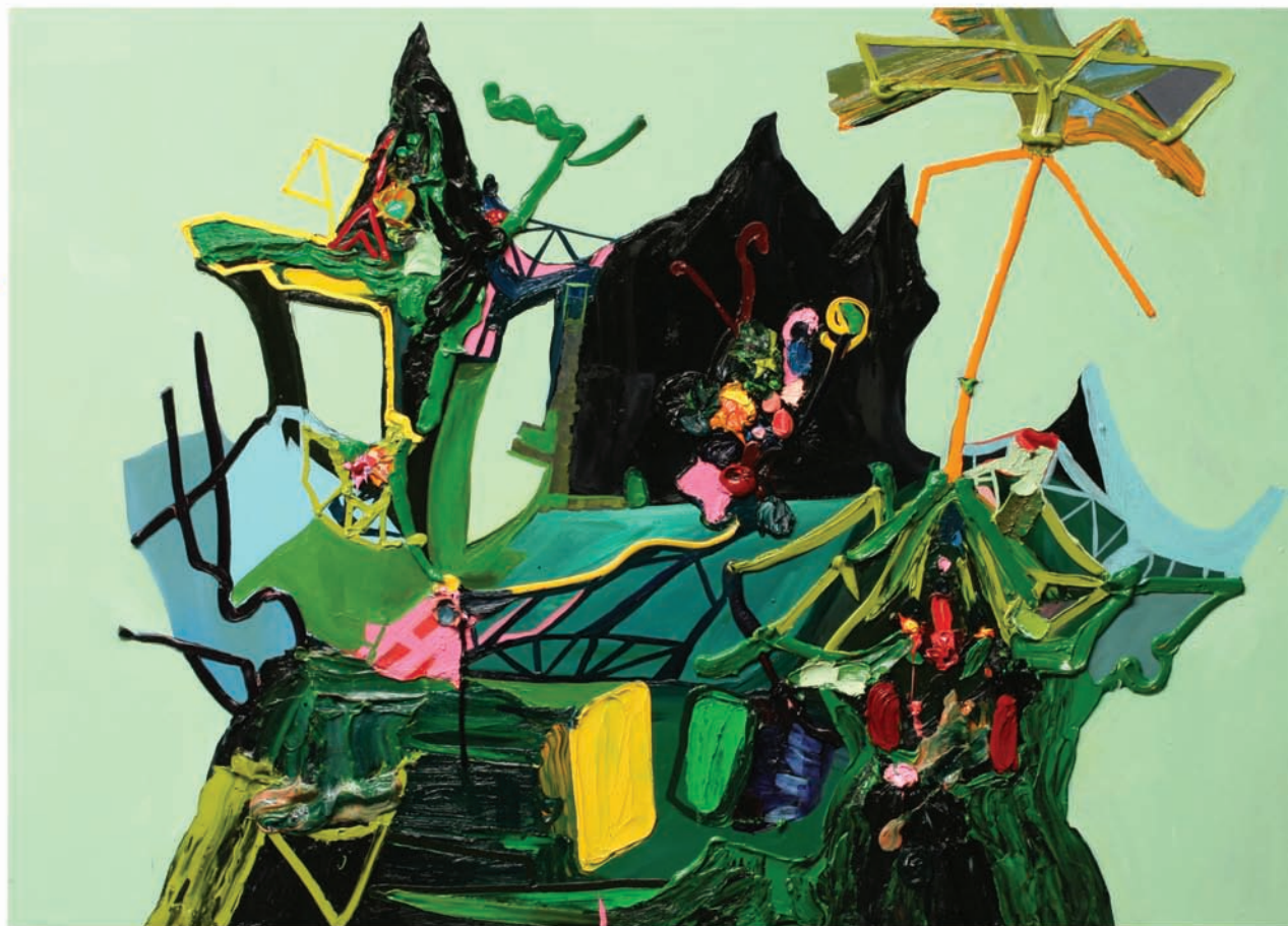
Green Spleen , 2007. Oil on canvas, 50 x 70 inches

– Elizabeth Anderson-Kempe, Artillery Magazine , 2008