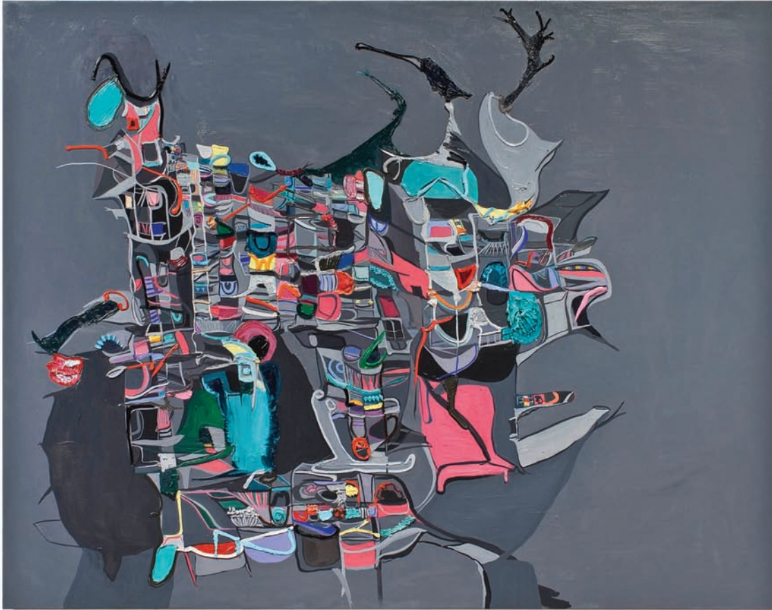
Territory , 2010. Oil on canvas, 70 x 90 inches

"Smith is an adept colorist, manipulating seductive combinations in the tradition of Matisse. Her expressive compositions include swaths of pure, beautifully mixed vibrant colors conversing with linear detail and architectural yet organic structures, that are at once playful yet precarious. Referencing the formalist ploys of abstract expressionism, her works attempt to give the historical trope new relevancy."