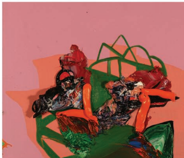
Little Folly , 2009. Oil and acrylic on canvas, 15 x 20 inches

Professional Artist Fellowship, City of Long Beach, 2008 Artist's Residency at Stichting Kaus Australis, Rotterdam, The Netherlands, June 2006 Painting's Edge Workshop, Idyllwild Arts, Idyllwild, CA, 2005 Marilyn Werby Memorial Fine Arts Scholarship recipient, California State University, Long Beach, Spring 2003