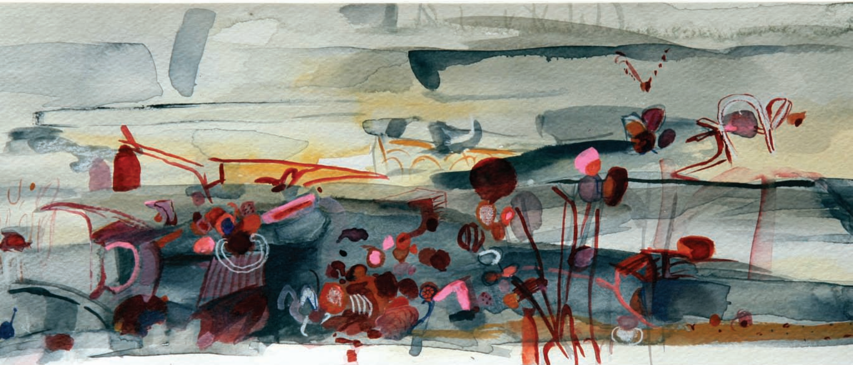
Longscape , 2009. Watercolor and gouache on paper, 6 x 17.5 inches Permanent collection of the Frederick R. Weisman Foundation, Los Angeles, CA