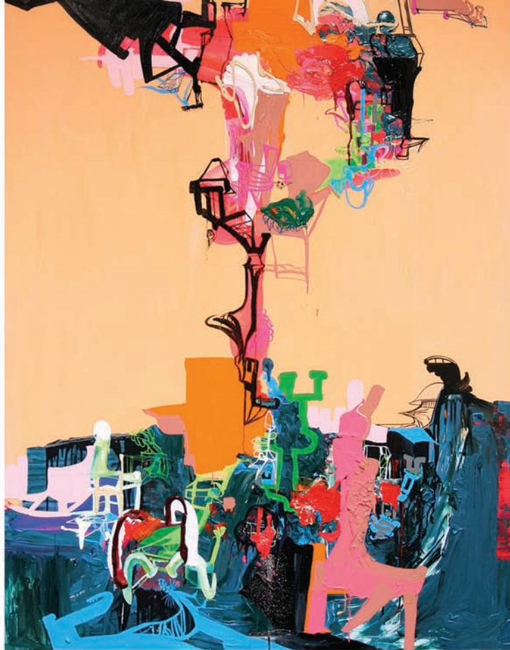
Left: Everything I Don't Understand #2 (Maidenhead Ancestry) , 2006. Oil on canvas, 70 x 50 inches Above: Everything I Don't Understand #3 (Masthead Ancestry) , 2006. Oil on canvas, 90 x 70 inches Progressive Insurance Permanent Collection, OH