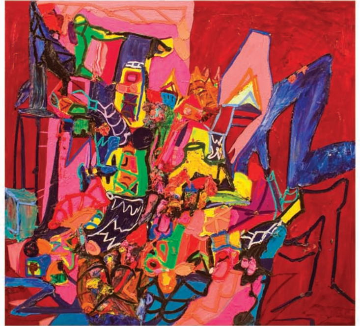
Right: Never Enough , 2008. Oil on canvas, 68 x 64 inches