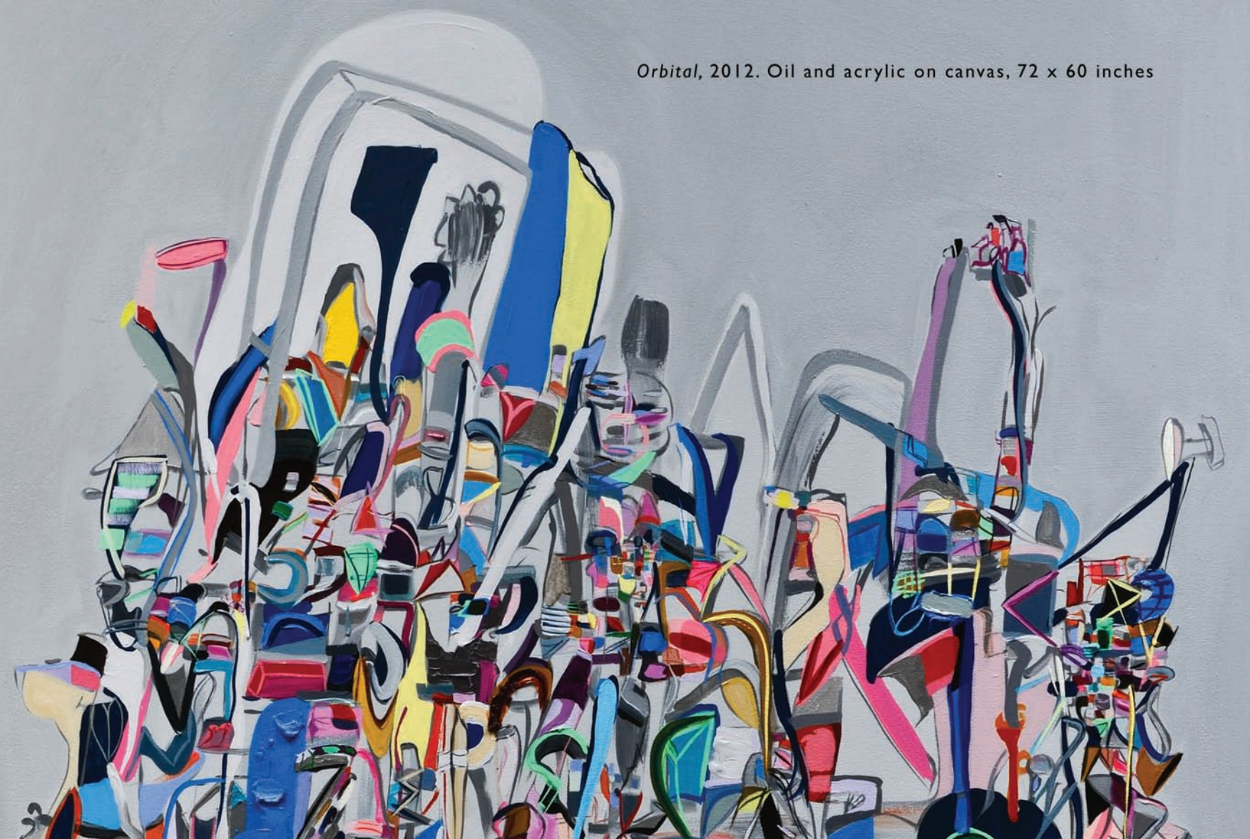
Orbital , 2012. Oil and acrylic on canvas, 72 x 60 inches