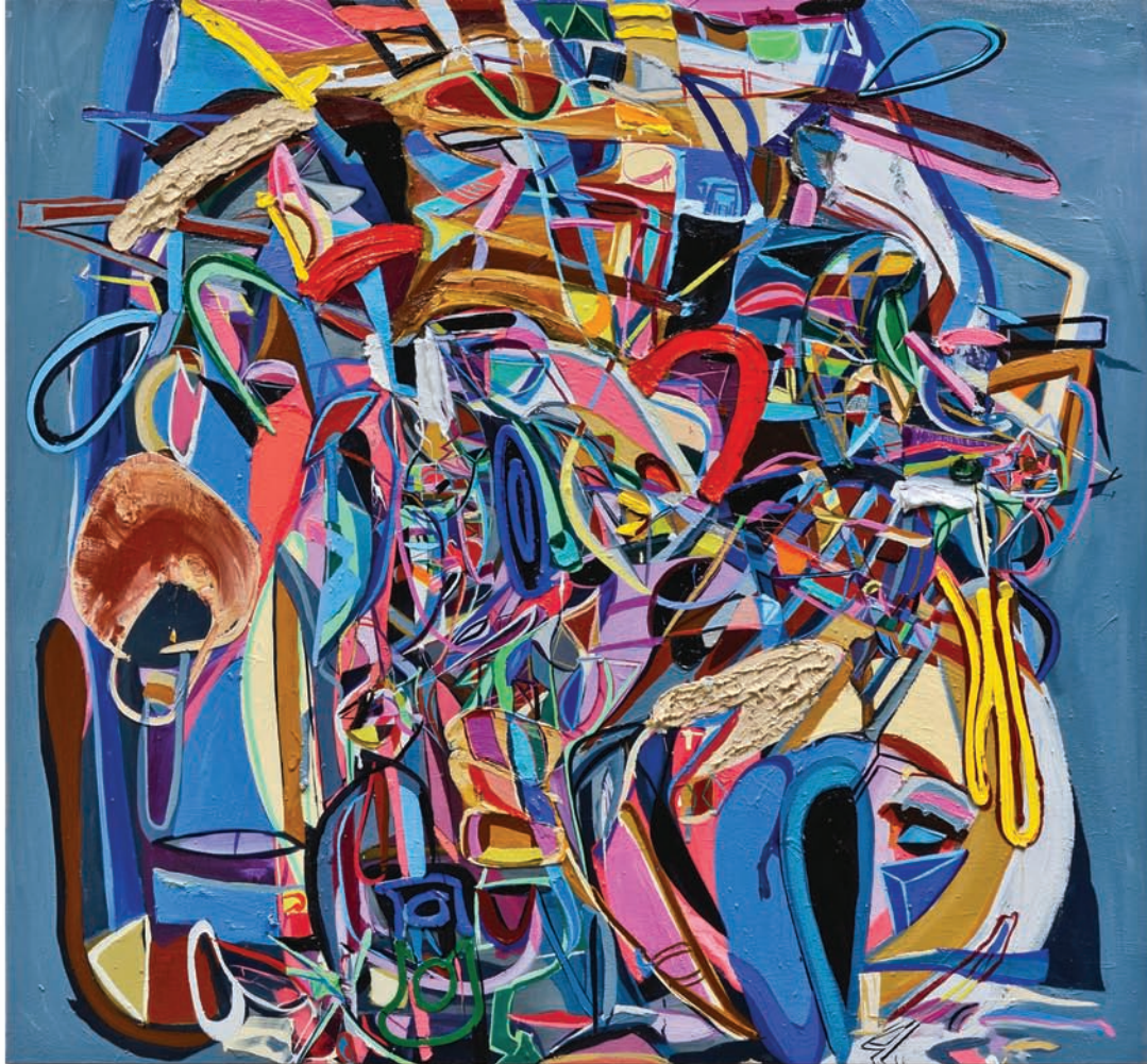
Above: Chart and Chain , 2012. Oil on canvas, 50 x 54 inches Opposite Page: Anemone #2 , 2006. Oil on canvas, 60 x 70 inches