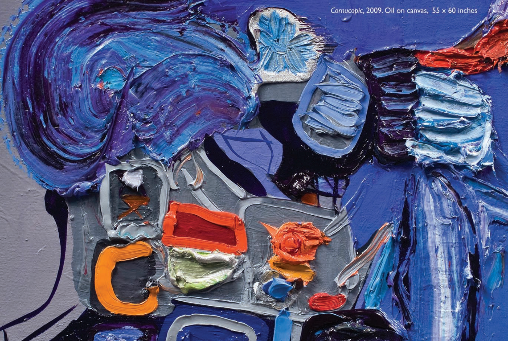
Cornucopic, 2009. Oil on canvas, 55 x 60 inches