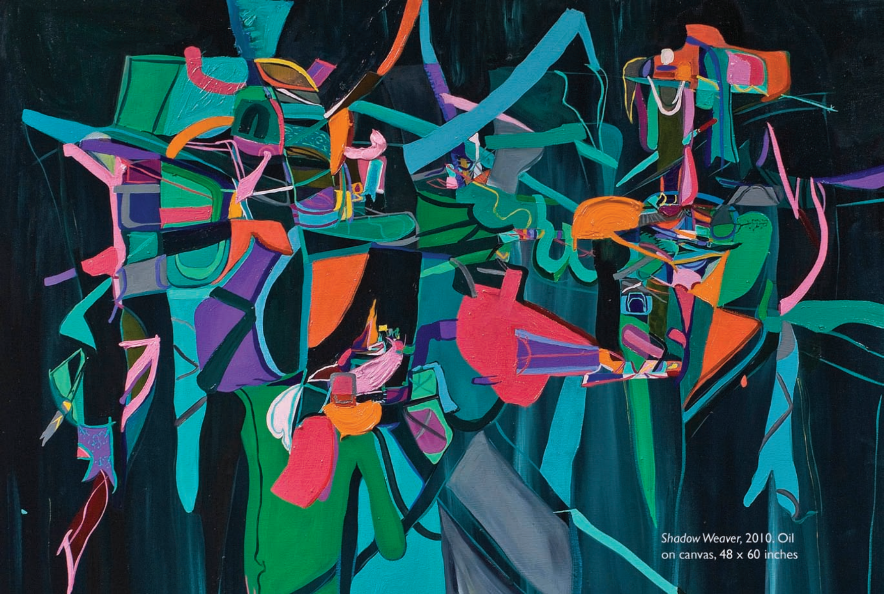
Shadow Weaver, 2010. Oil on canvas, 48 x 60 inches