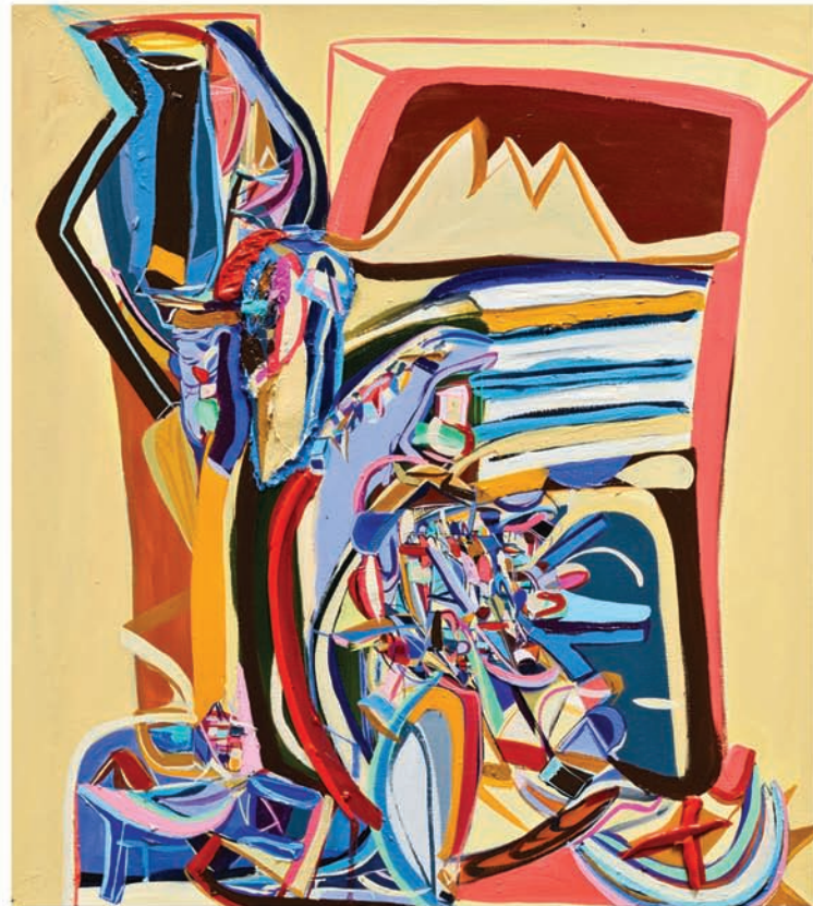
Left: Recto Verso , 2012. Oil on canvas, 68 x 64 inches Right: Yellow Mount , 2012. Oil on canvas, 36 x 32 inches

Opposite Page: Banquet , 2011. Oil on canvas, 54 x 50 inches