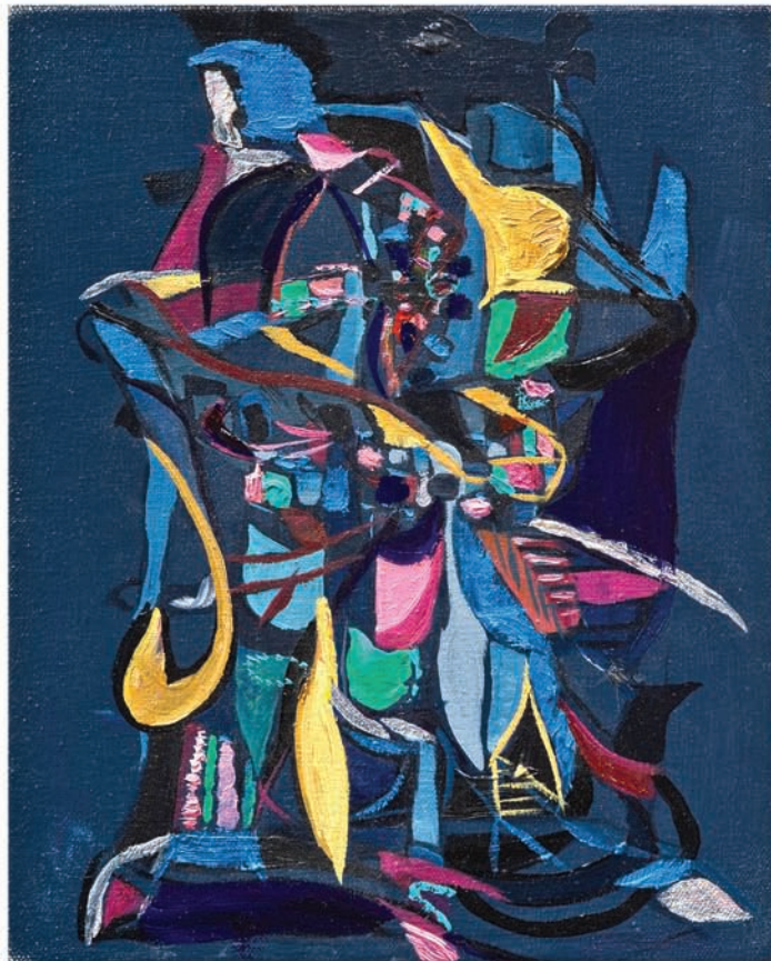
Left: Crimson , 2011. Oil on canvas, 10 x 8 inches Right: Civil War , 2011. Oil on canvas, 10 x 8 inches

Opposite Page: Arena Eruption , 2010. Oil on canvas, 70 x 90 inches