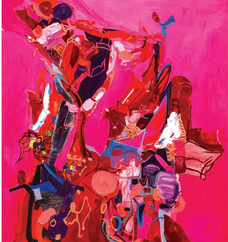
Geek Love , 2008. Oil and acrylic on canvas, 92 x 84 inches

– Elizabeth Anderson-Kempe, Artillery Magazine , 2008