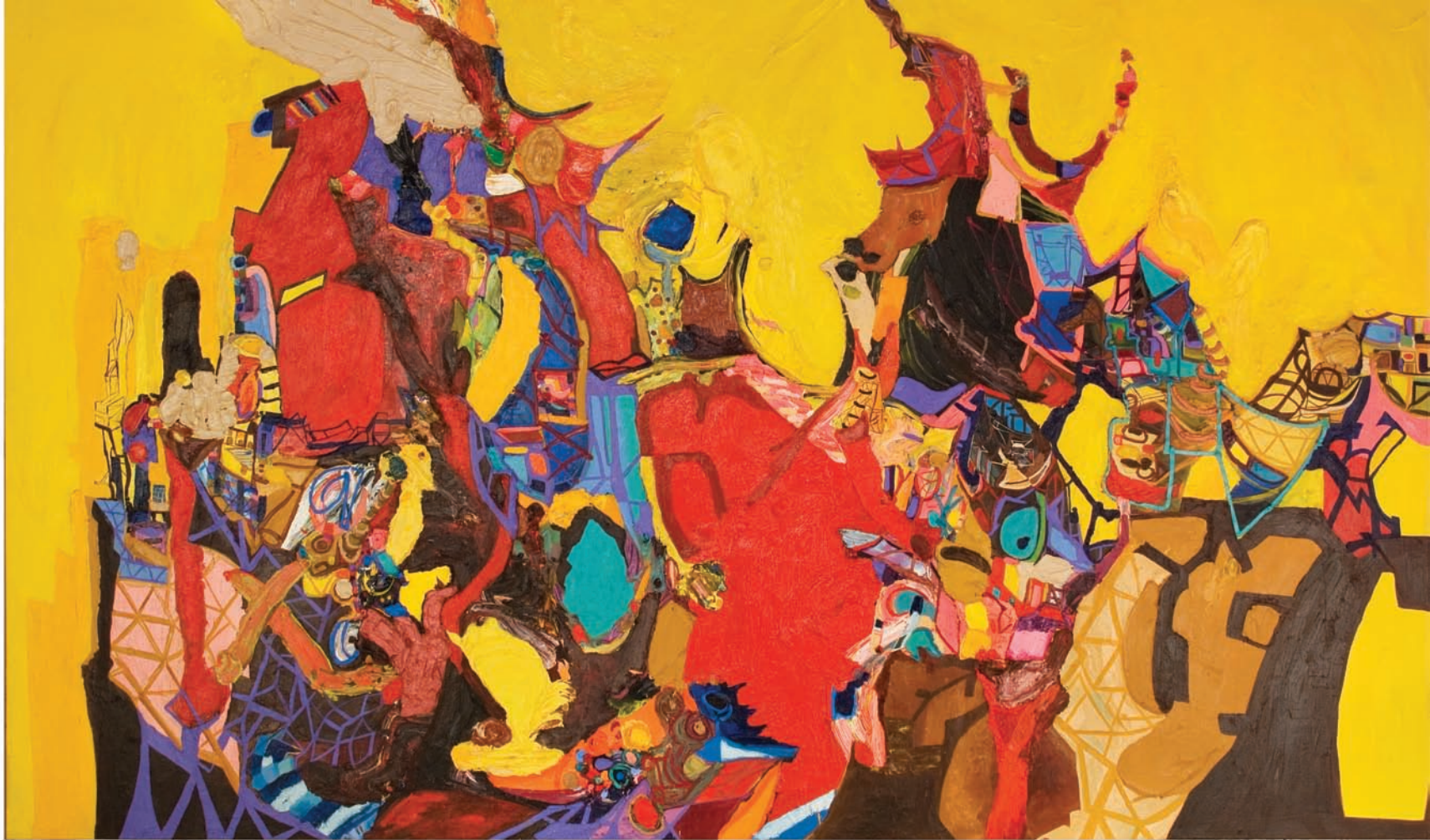
Half-Life , 2007. Oil on canvas, 84 x 130 inches Permanent Collection of the Frederick R. Weisman Foundation