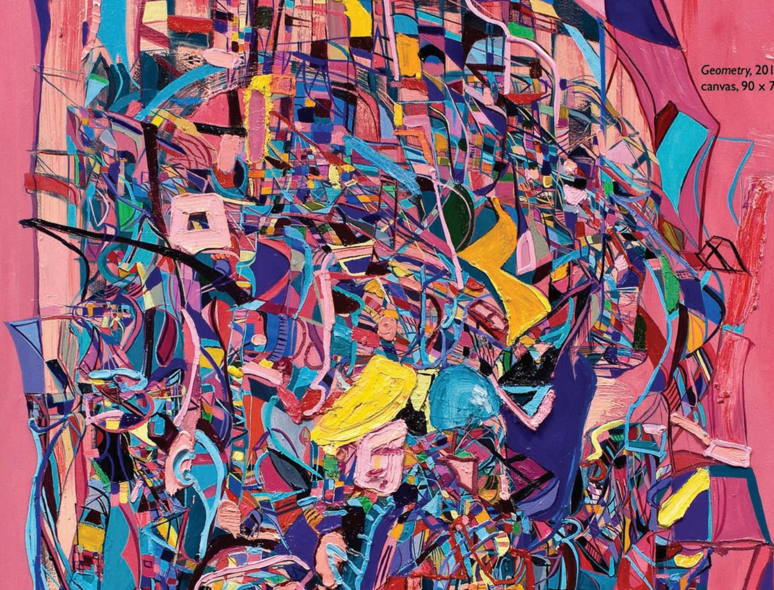
Geometry, 2011. Oil on canvas, 90 x 70 inches