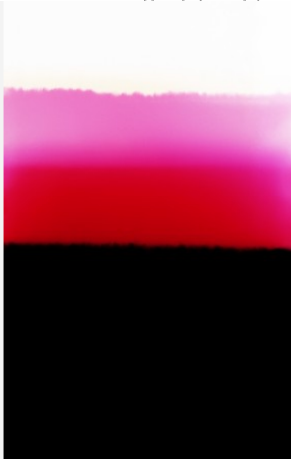
Silvio Wolf's "Chance 03 (Horizon 16)"

Millions of pictures of the same thing taken by different people at different times, the images lend themselves to a discussion of the Internet as an index for mediated human vision. Meanwhile, the glossy surface and myriad colors of the prints lend a plastic carnival ride look to the pilfered image amalgamation and you can't help but look at the bright, beautiful glow. As Yoko Ono instructed, "Watch the sun[s] until [they become] square."