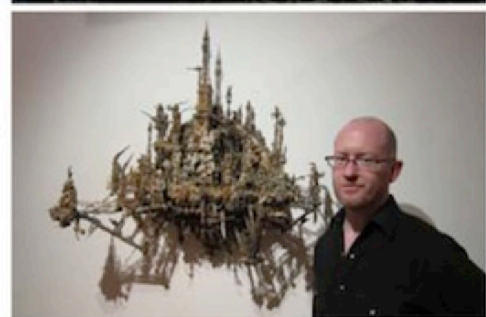
TOP LEFT: ANDROMEDA, DETAIL RIGHT: IMMINENT UTOPIA