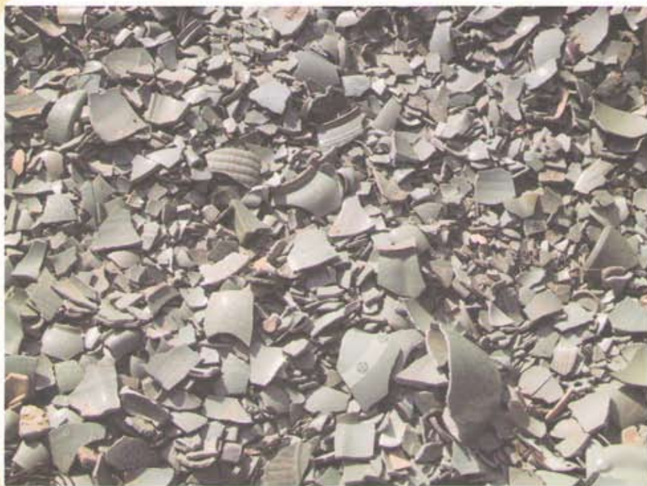
Ford Family Activity Guide, The Museum of Modern Art