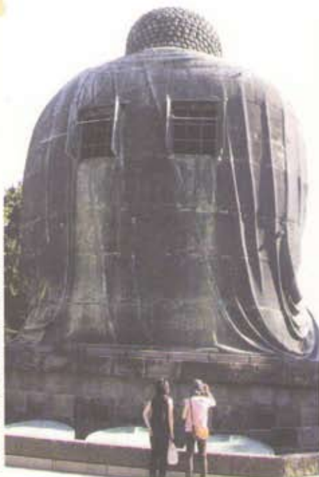
Ford Family Activity Guide, The Museum of Modern Art

In Japan, there is a bronze statue of Buddha that is unique because you can walk inside. It is very unusual to enter a sacred space of this kind, to experience the space within the body of the Buddha. Once inside, you can look up into the dark, empty space inside the statue's head. It's a void you cannot enter. You can only imagine what's there.