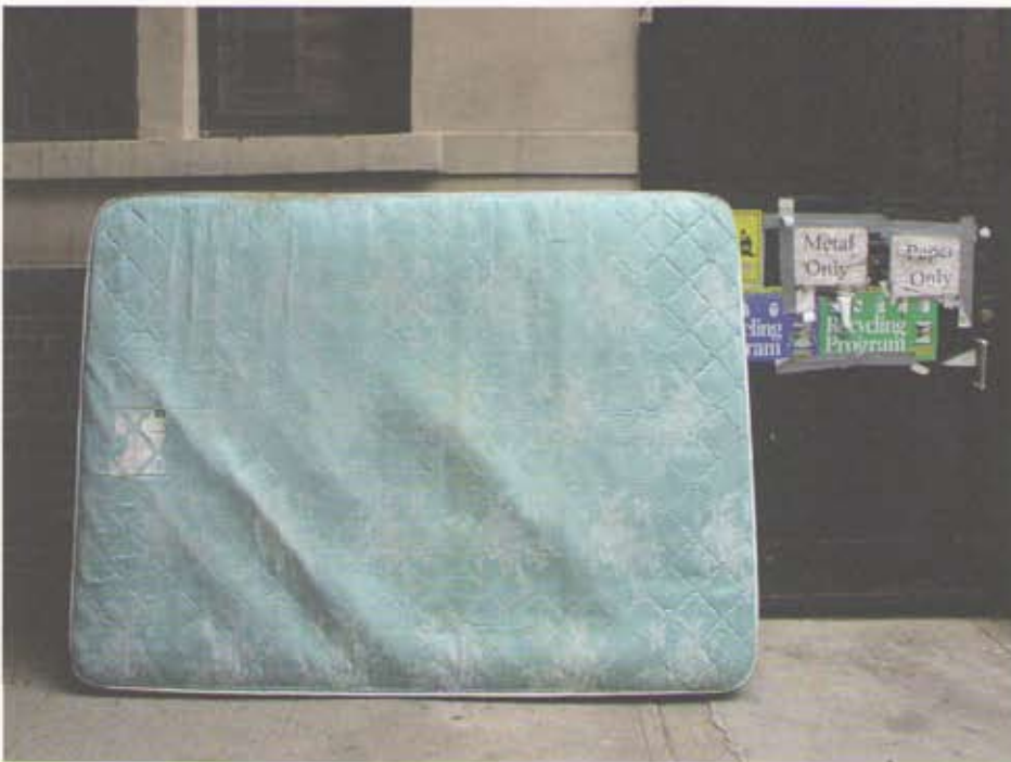
From Family Activity Guide, The Museum of Modern Art

Walking down the streets of New York City, I found an abandoned mattress. It seems vulnerable outside, stripped of its comforts. Such a stark contrast between the aqua-colored mattress and the hard, cold, grey concrete sidewalk. I wonder who slept on this bed. I imagine someone dreaming and rolling over.