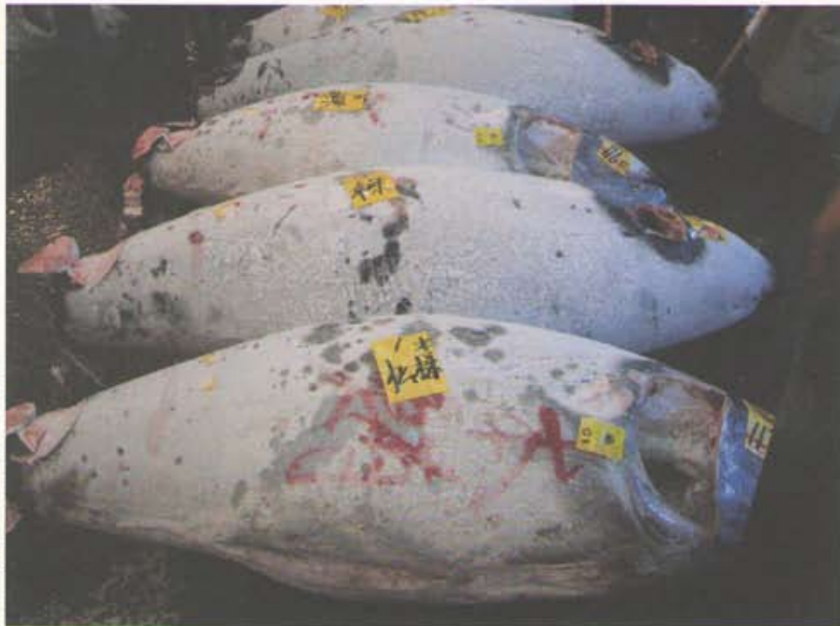
Ford Family Archive's Guide, The Museum of Modern Art

Very early one morning I saw gigantic tuna being sold in Tokyo's fish market. Lying frozen on the ground, the tuna looked less like fish and more like heavy stone or solid steel.