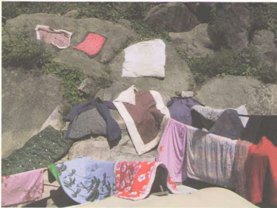
Ford Family Activity Guide, The Museum of Modern Art