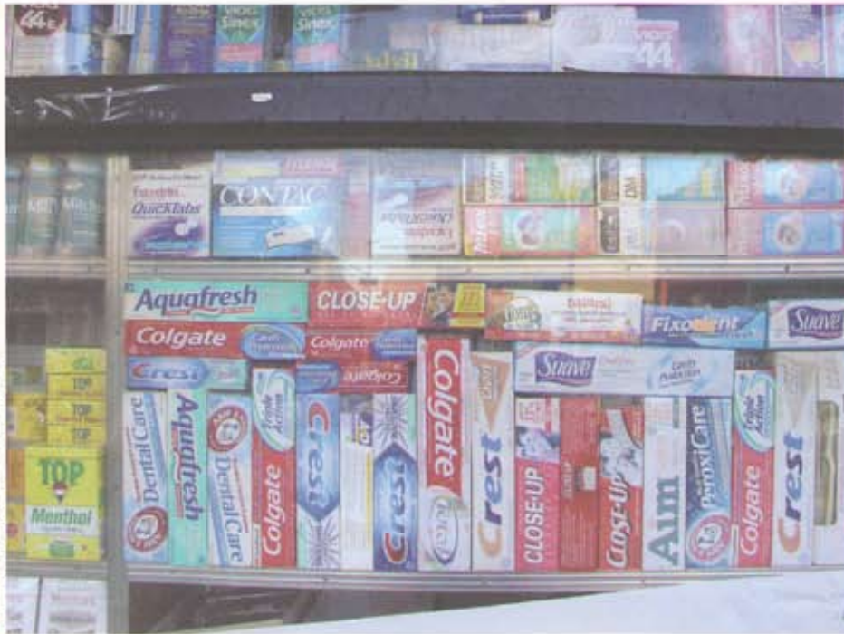
Food Family Activity Guide, The Museum of Modern Art