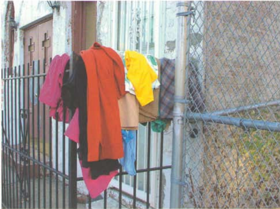
Ford Family Activity Guide, The Museum of Modern Art