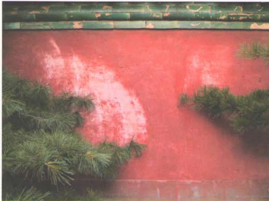
Ford Family Activity Guide, The Museum of Modern Art

The wind blows through the palaces of Beijing, moving the pine branches. Over time, the branches have worn away paint on the wall. The invisible element of wind reveals itself by leaving its mark on the architecture - nature's way of erasing.