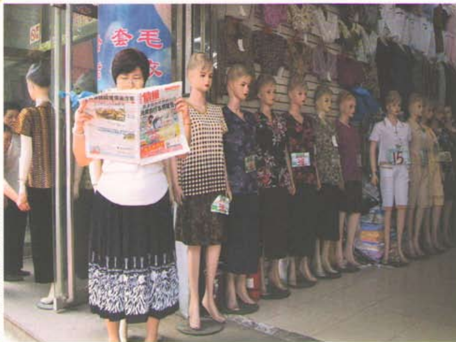
First Family Activity Guide, The Museum of Modern Art