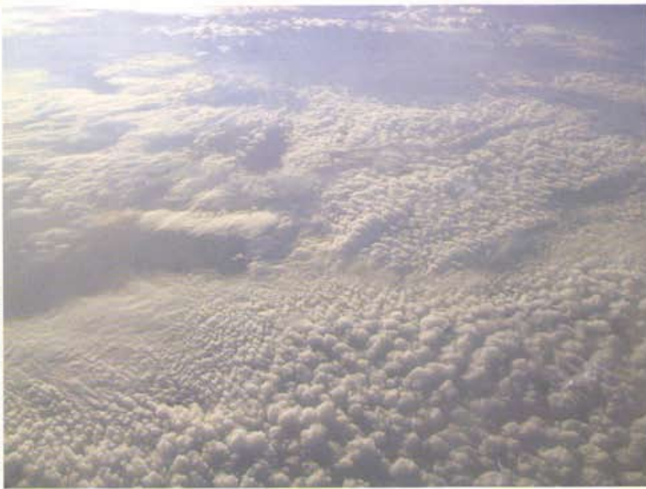
Ford Family Activity Guide, The Museum of Modern Art

Whenever I fly somewhere, I photograph the cloud formations outside the airplane window. The clouds change so quickly, like fleeting, abstract drawings. The clouds suggest a white landscape that is always changing, revealing and hiding what is underneath.