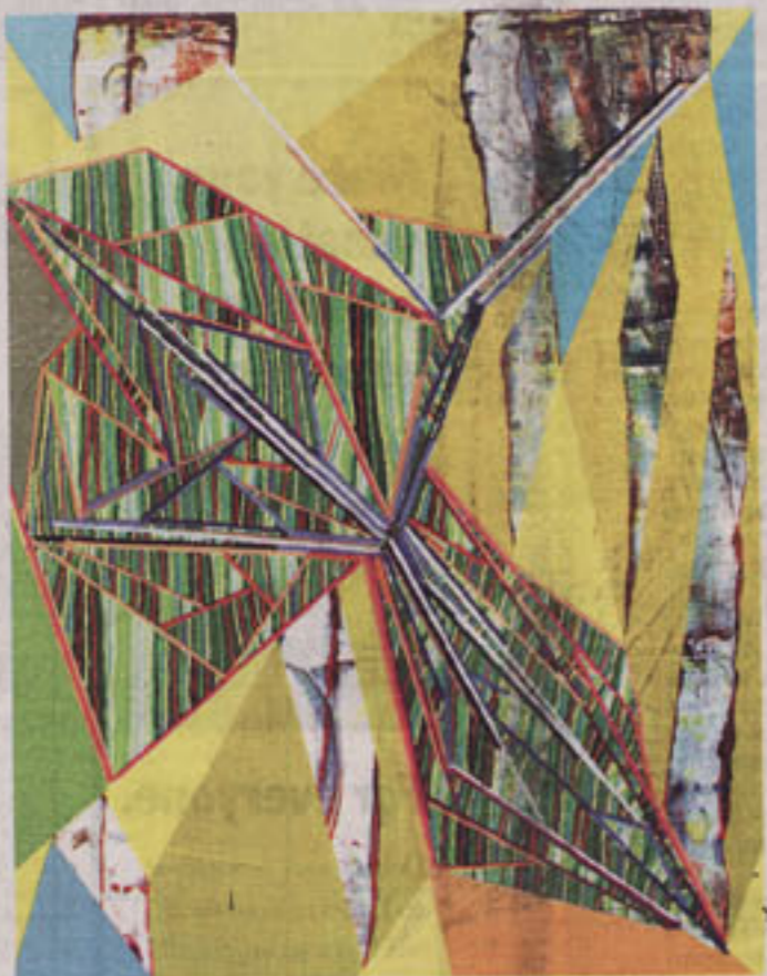
CAREFULLY DESIGNED: The shapes and colors in Roden's "celestial fallings and flyings" are not by chance.

Olsen has painted vending machines, ATMs, parking meters, bus shelters, gas stations and department store mannequins, often on small panels and frequently at night. Color is minimal, luminescence maximized, healthily pallor merges with implications of anxiety and small disaster. The pictures have the specificity and presence of portraiture, resonating with the bleak beauty of American life today.