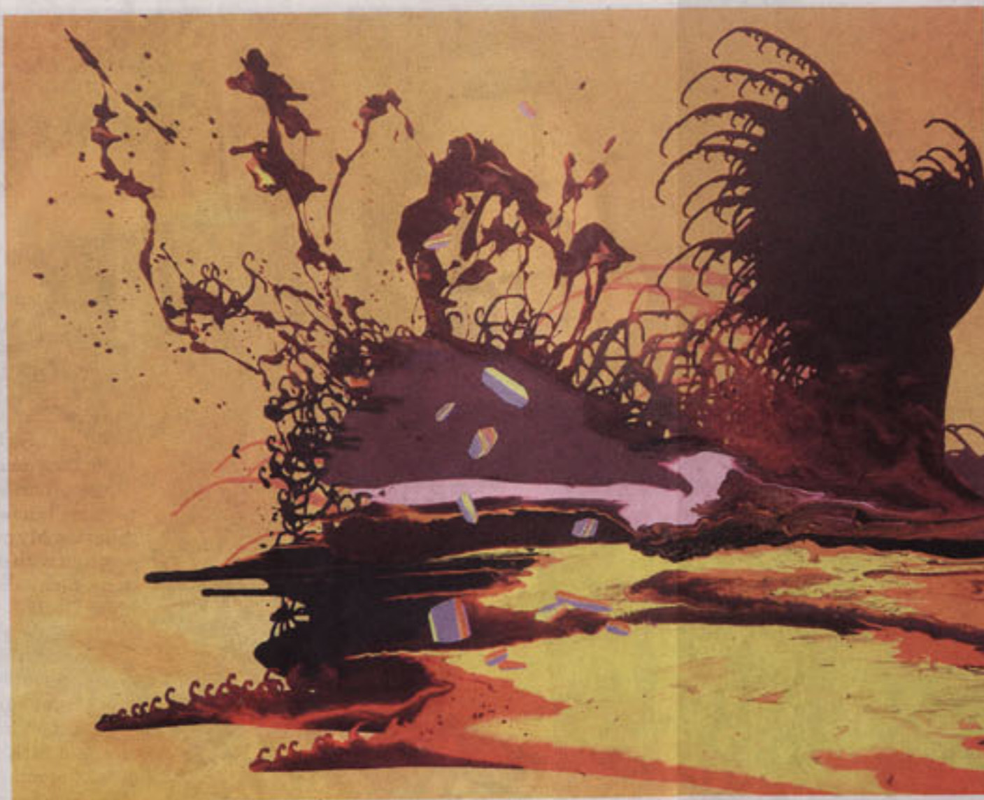
ABSTRACTION: The fluid movement of paint crashes into geometry in "Pop Rocks," Callister's acrylic-on-canvas painting.