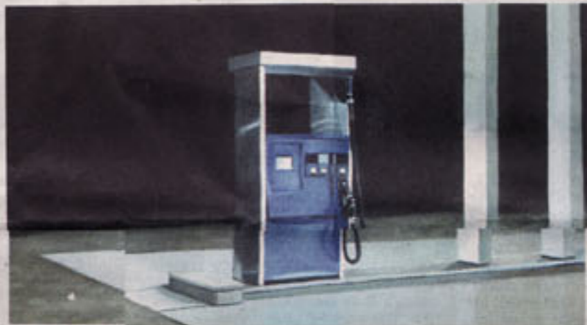
BLEAK: Olsen uses minimal color to great effect, as in this untitled work.